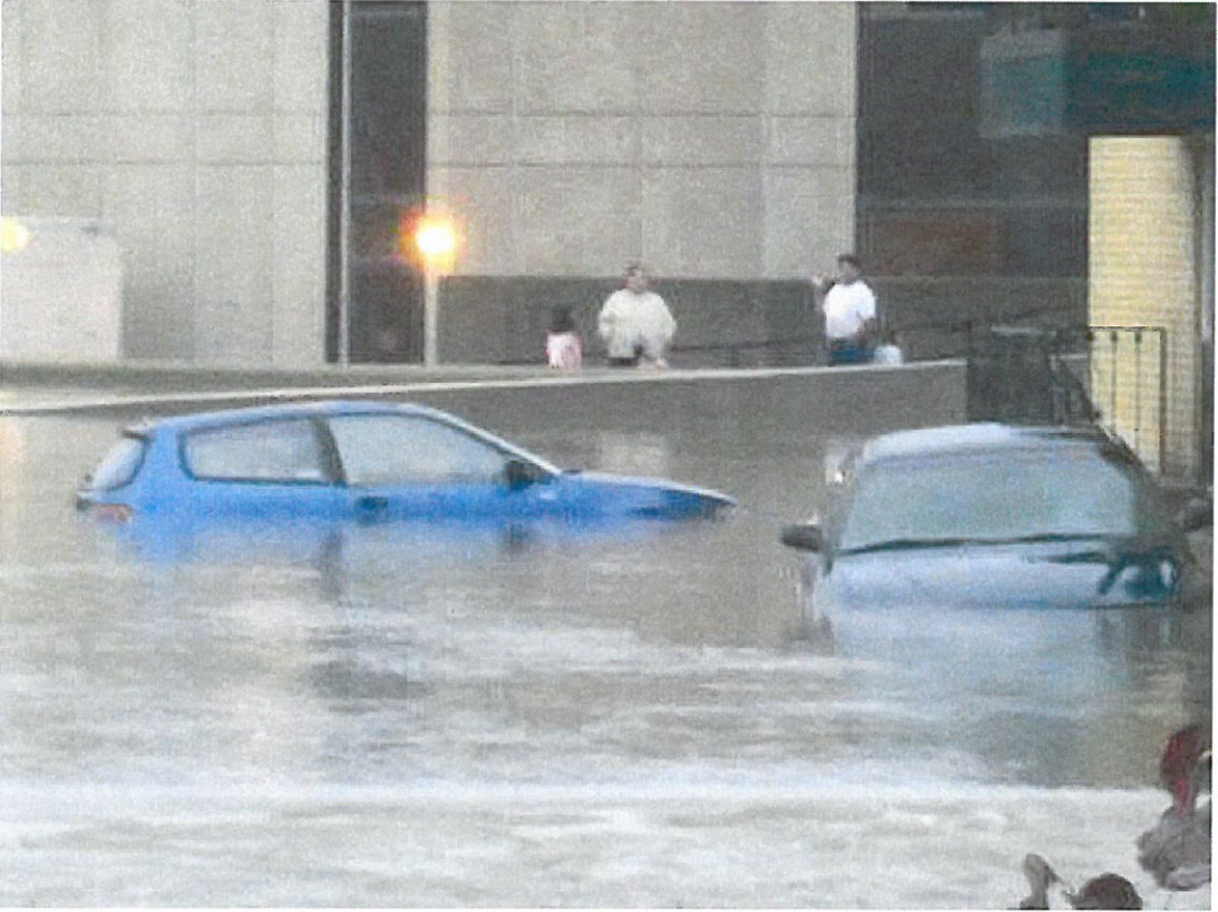
Downtown Hobart Flooding in Alley West of Main St. – 2008