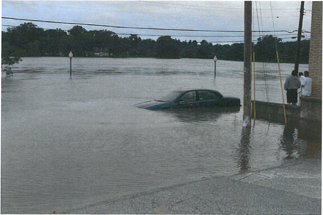
2 nd Street under water. – 2008