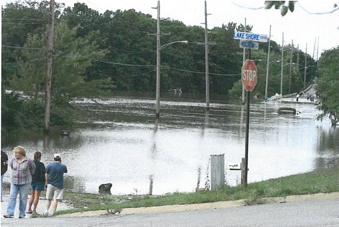
Wisconsin Street with National Guard Truck on the causeway. - 2008